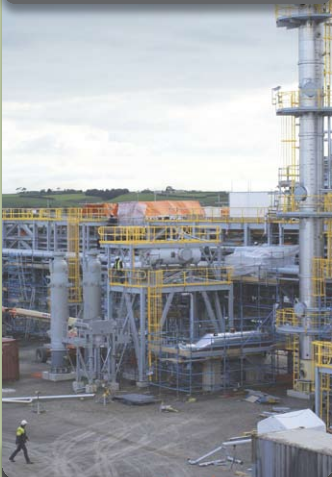
Pipe Rack at Kupe Production Station