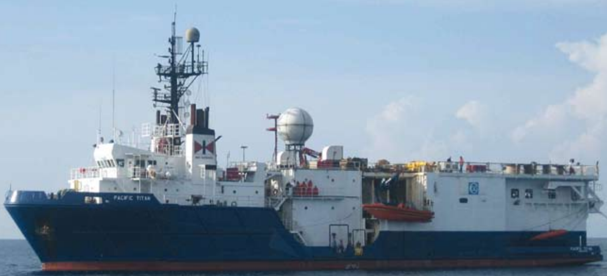
The Pacific Titan Seismic Vessel

A marine seismic survey was carried out in this permit by the Pacific Titan in November/December 2008. Approximately 1,100 km of 2D seismic was shot. The collected information is currently being processed and interpretation of the data is expected to begin in the second quarter of 2009.